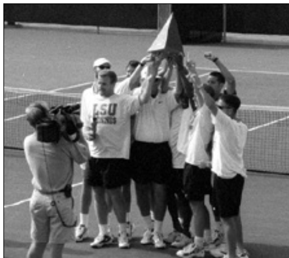
The 1998 & 1999 men's tennis teams won back-to-back SEC championships

Note: Before 1990, the SEC champion was the winner of the flighted tournament held at the end of the season.